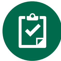
Site-Level Performance Data