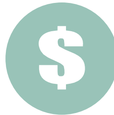
Prioritization of Client Investment Needs