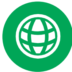
Global Standards and Governance