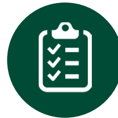
Supplier Quality Management