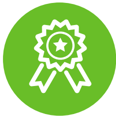
“Best of Breed” Supplier Partnerships