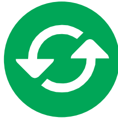
Prevent Business Interruptions