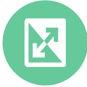
Scale of Operations