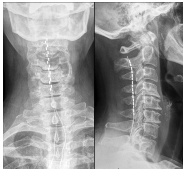
Figure 1 Antero-posterior and lateral radiographic view of the cervical spine to demonstrate the final position of the implanted leads within the posterior epidural space.

As this was an exploratory study, no primary endpoint was defined. However, a range of efficacy mea-